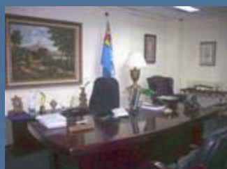
The President Office