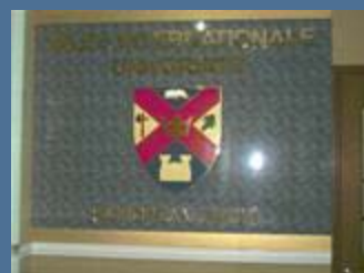
The Front Reception Area